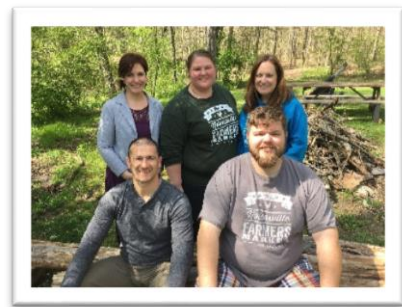
TAFM Member Market – Spotlight on Nolensville Market